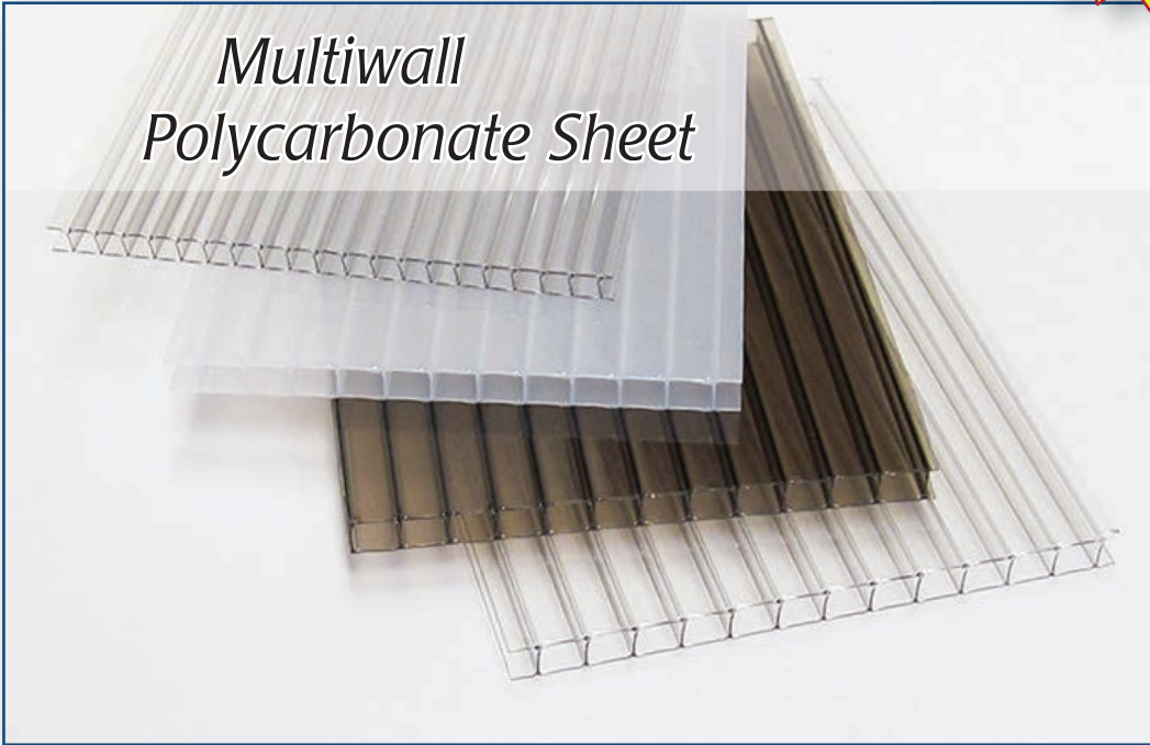
Multiwall Polycarbonate Sheet

Extended Warranty adds 5 Years for 15 Years Total Coverage!