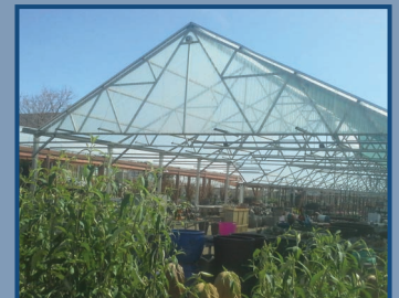
Greenhouse - Exterior View