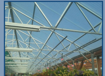
Greenhouse - Interior View