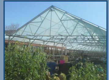
Greenhouse - Exterior View