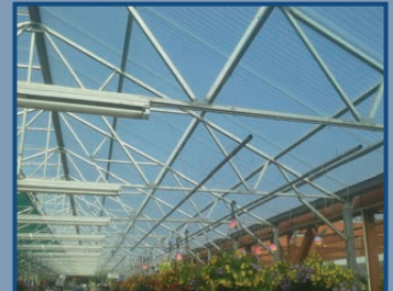
Greenhouse - Interior View