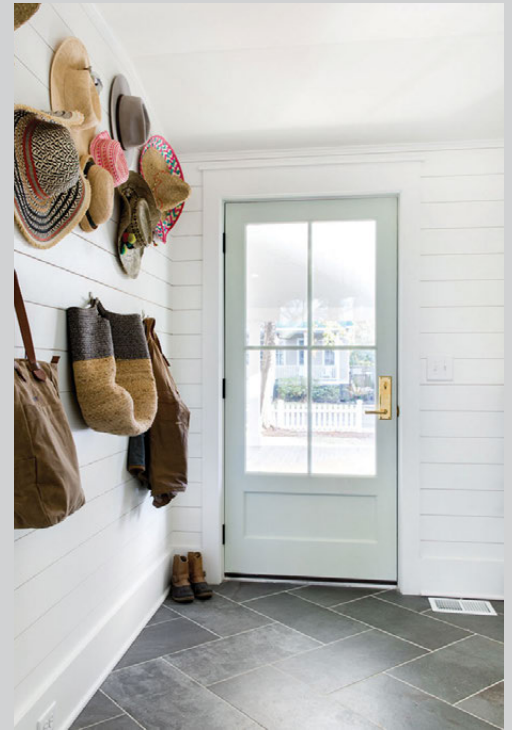
Where function meets style!

Note: EZ Slatwall trims and EZ Liner trims are not interchangeable.